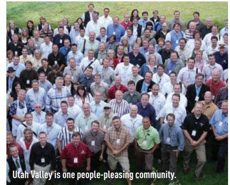
Utah Valley is one people-pleasing community.

For the 226,209 people working in the valley, it's the people they work, network and meet with every day that make Utah Valley a great place to work. Submissions for "Best Part of Utah Valley's Business Scene" included "great people," "nice people" and "honest people." But however you want to describe them, the people take the cake.