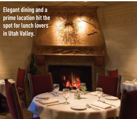
Elegant dining and a prime location hit the spot for lunch lovers in Utah Valley.